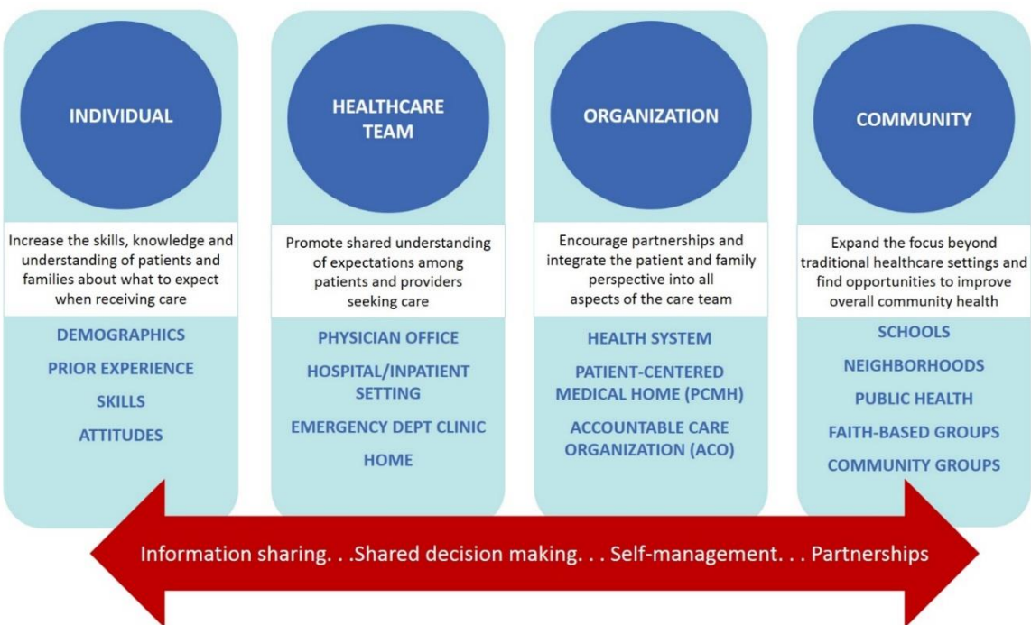
Framework spanning a continuum that includes the patient, healthcare team, the organization and the larger community.<sup>1</sup>

You probably already involve patients and their family in discussions if a serious condition develops that's life-threatening. However, the real goal of patient engagement is to encourage shared decision making on an ongoing basis. The patient, their family or caretakers and the physician become a team who together consider treatment options and weigh risks to develop a care plan. For example, we know that patients with uncontrolled diabetes are much more likely to better manage their condition at home if they're actively engaged. Patient engagement relies on a number of factors depending upon the individual – they can include a relationship between the patient and the care team, ongoing patient education, partnerships with non-clinical organizations, and the proper use of available technology to keep patients engaged in their own wellness.